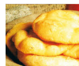
RICE or NAN